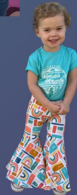
Trunk or Treat